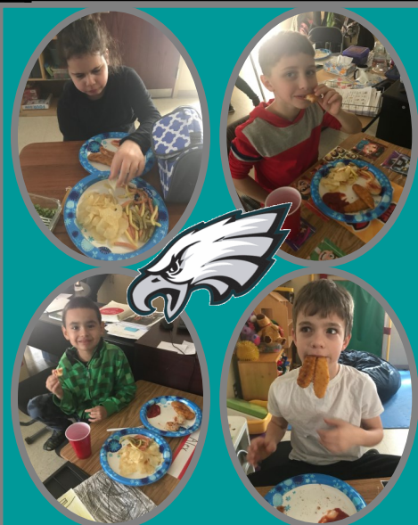
Class 3 Super Bowl Party