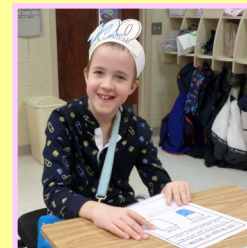
A Snowy Day Interactive Class 2 & Preschool