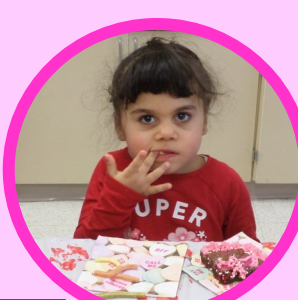
2/9/2018 Valentine's Day Dance